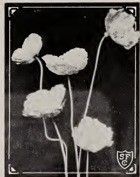
ICELAND POPPY COCNARA PINK. Exquisite new salmon pink sort, a select cut flower easily grown. Young plants, 6 for 50c.